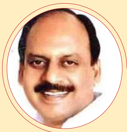
Thiru. T. M. Anbarasan Hon'ble Minister for Micro, Small and Medium Enterprises (MS & ME), Government of Tamil Nadu