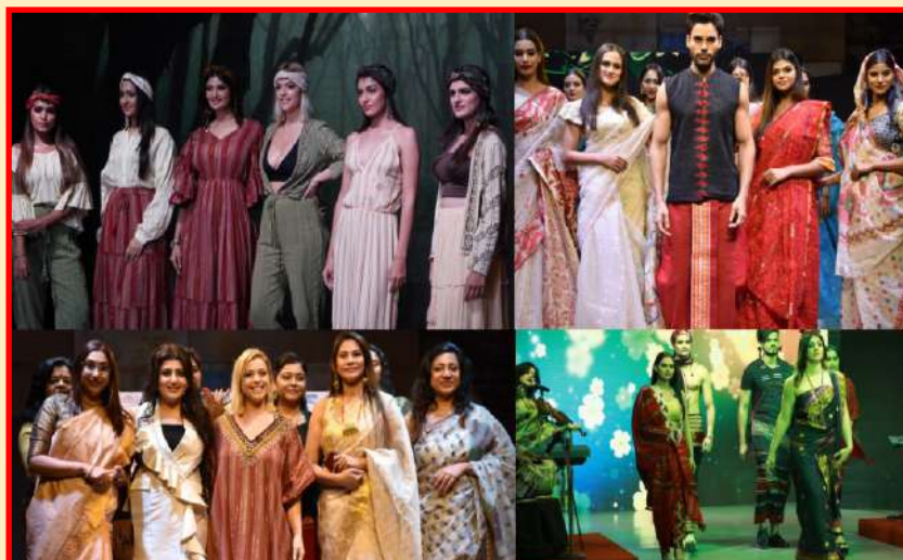
WORLD TRADE CENTER MUMBAI