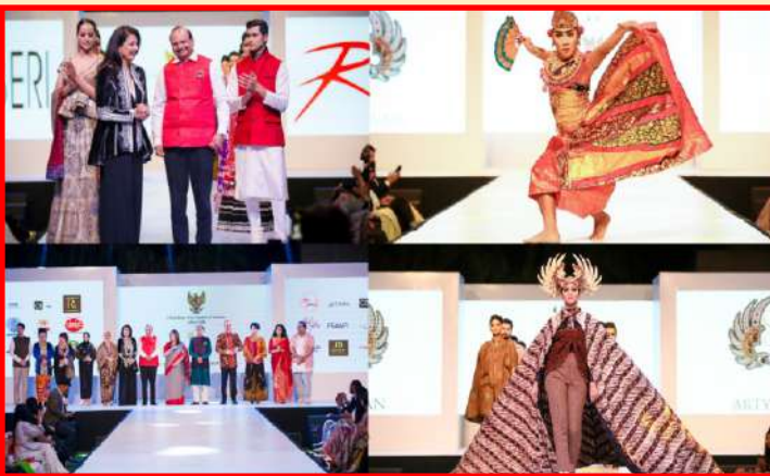
EMBASSY OF REPUBLIC OF INDONESIA NEW DELHI