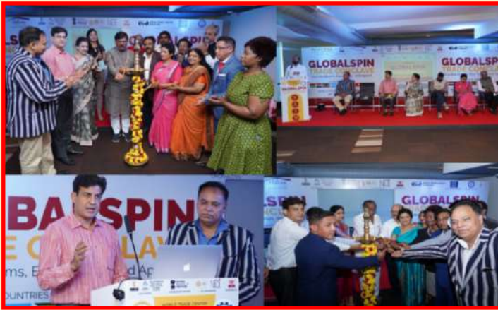
WORLD TRADE CENTER BENGALURU