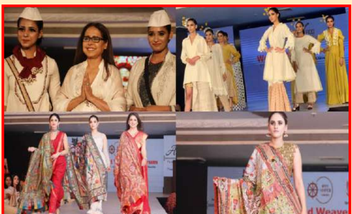
FICCI LADIES ORGANIZATION (FICCI FLO) LUDHIANA