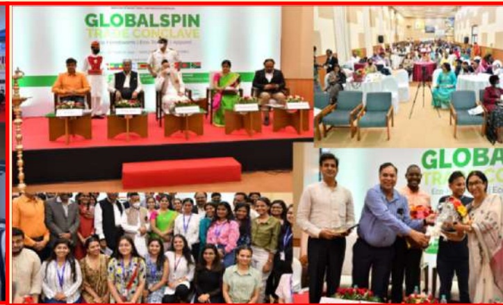
WORLD TRADE CENTER MUMBAI