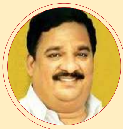
Thiru R. Gandhi Hon'ble Minister for Handlooms and Textiles, Khadi and Village Industries Board, Boodhan and Gramadhan Government of Tamil Nadu