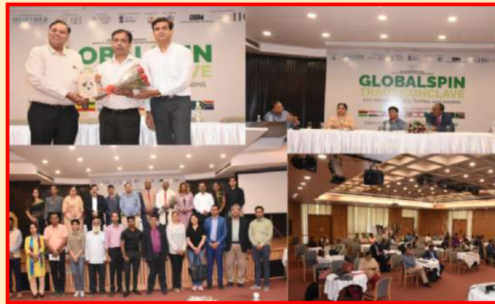
INDIA INTERNATIONAL CENTRE NEW DELHI