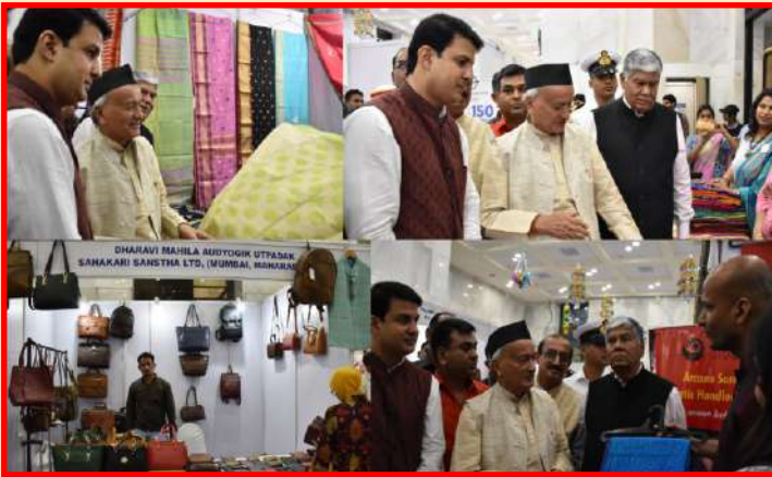
WORLD TRADE CENTER MUMBAI