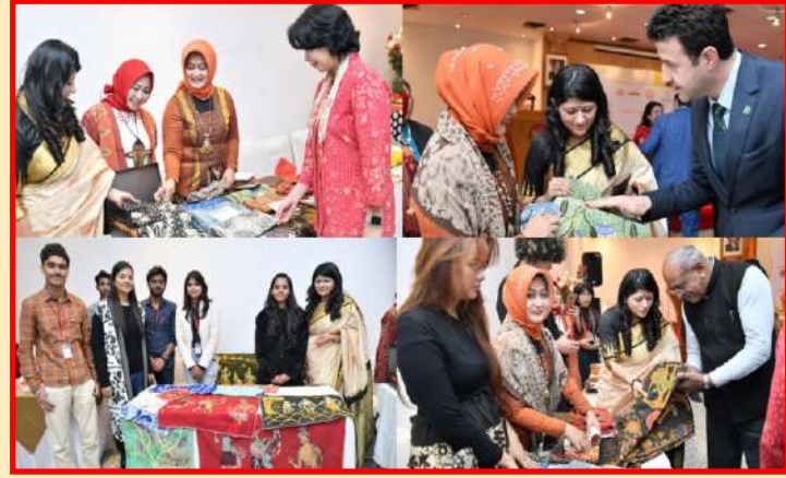
EMBASSY OF REPUBLIC OF INDONESIA NEW DELHI