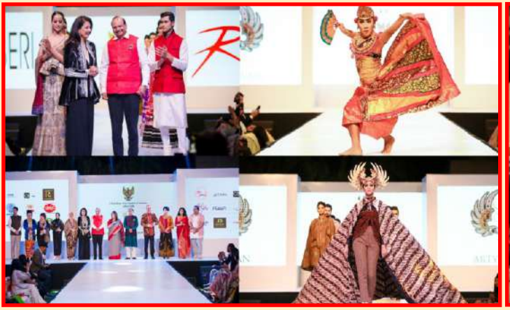
EMBASSY OF REPUBLIC OF INDONESIA NEW DELHI