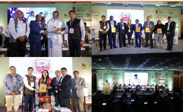
CROWNE PLAZA CHENNAI, ADYAR PARK