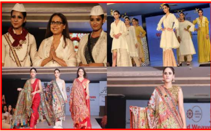
FICCI LADIES ORGANIZATION (FICCI FLO) LUDHIANA