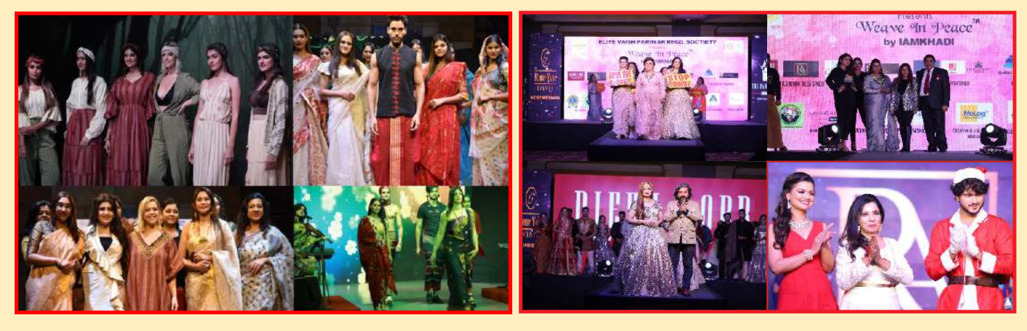
WORLD TRADE CENTER MUMBAI